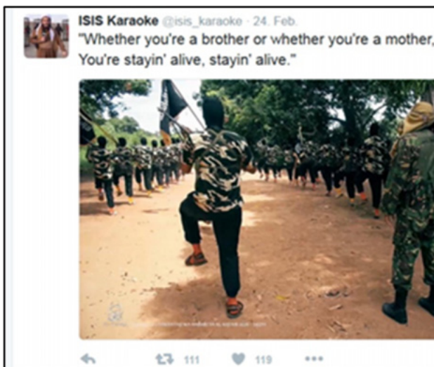
Figure 13: @isis_karaoke IS fighters dance presumably with “Stayin’ alive”.