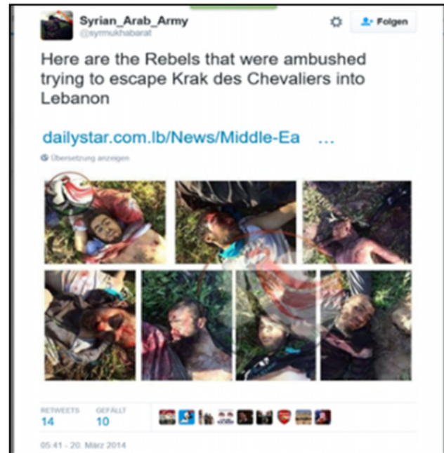
Figure 2: Tweet from @syrmukhabarat.

Besides the news articles, @ThinkAgain_DOS also posts pictures or videos, which are supposed to communicate educational messages. Under #UnitedAgainstDaesh a picture (Figure 3, 09.03.2016) was posted, which shows an Iraqi woman and a girl, who sit on a couch side by side and look seriously: “For one hour a day they electrocuted me: cables to my head, hands and feet. I was crying and begging him to stop, but he wouldn’t listen.” Iraqi woman held captive by ISIS for 4 months.” The comment on the picture says: “#UnitedAgainstDaesh: Coalition seeks to destroy the evil perpetrators of extreme violence against”. The post’s