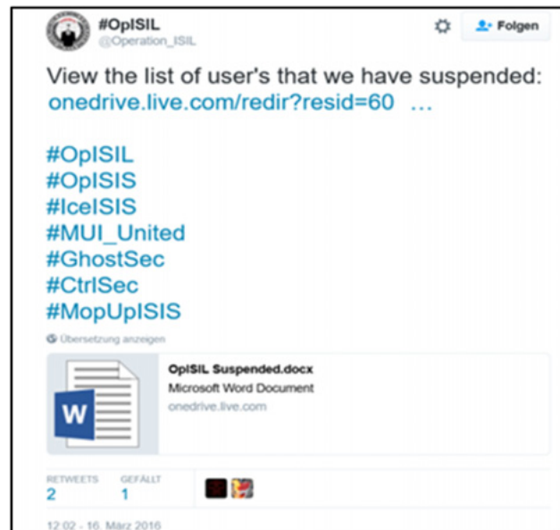
Figure 14: Tweet from @Operation_ISIL.