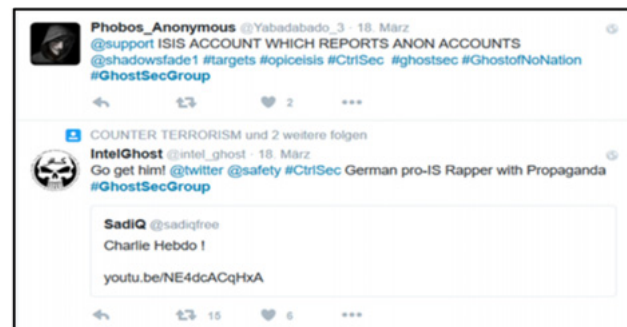
Figure 15: Tweets about #GhostSecGroup.

have been disarmed. Figure 15 illustrates that there is a possibility for everyone to join the war against extremist groups. For this, all users are asked under appropriate instructions to report conspicuous accounts. Other activities are kept hidden from the social network since it involves illegal activities, which are not intended for the public. The success of these hacker attacks remains questionably as numerous sites are callable despite many barriers. Hackers can also be ‘haunted’ by ISIS users. They fight among each other and simultaneously call for a hunt. In the post from 18 th March 2016, @intel_ghost draws attention to a