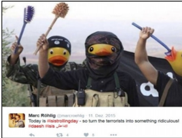
Figure 6: #TrollingDay IS fighters as bath ducks.