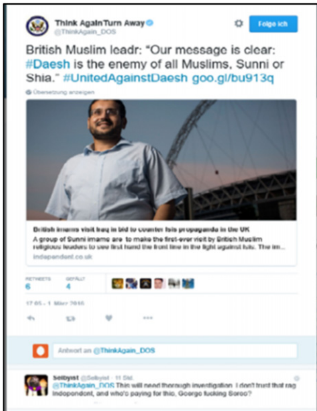
Figure 1: Tweet from @ThinkAgain_DOS.

bodies, which is decorated with the logo of the Syrian-Arabic army and a link to a newspaper article (Figure 2): “Here are the Rebels that were ambushed trying to escape Krak des Chevaliers into Lebanon” (20.03.2014). The comment from @syrmukhabarat assigns the dead to the rebel groups. The news paper article headlines: “11 rebels killed fleeing famed Crusader fort: Syria army” (20.03.2014). Therefore, it connects the two even though the source of the picture is not clear. @ThinkAgain_DOS comments: “[...] They could also be #alquaeda fighters whom #Assad used to send to Iraq and Lebanon #thinkagainturn-away” (20.03.2014). Thereby, the discussion on the unclear source of the picture has been opened and following speculations have been made.