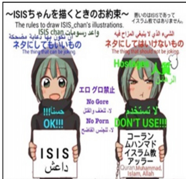
Figure 10: Guidelines for ISIS Chan.