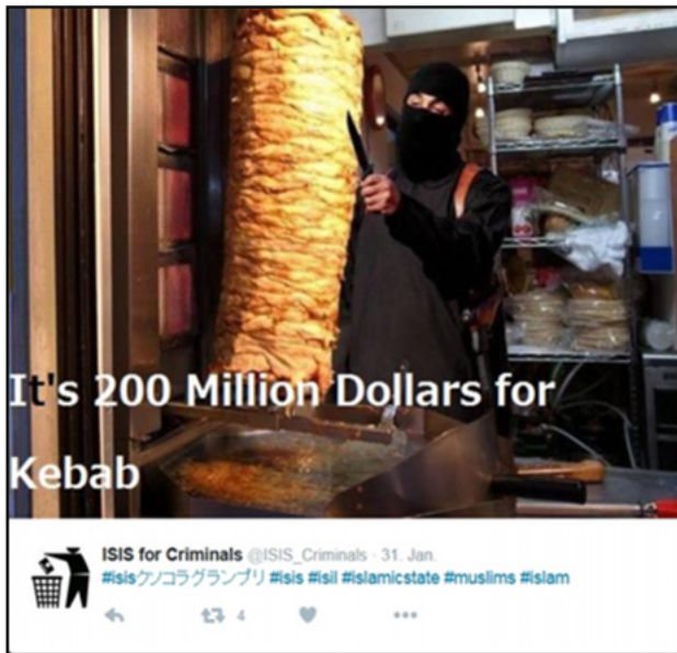
Figure 12: #ISISCrappyCollageGrandPrix IS fighter with kebab.