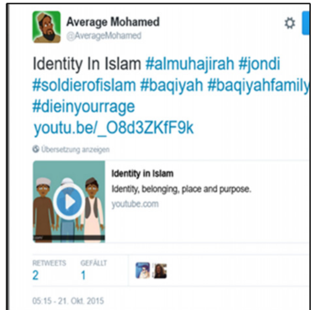
Figure 5: Tweet by @AverageMohamed.

Parody is a hilarious satirical imitation by distortion and exaggeration. The satire is a genre, which criticizes and