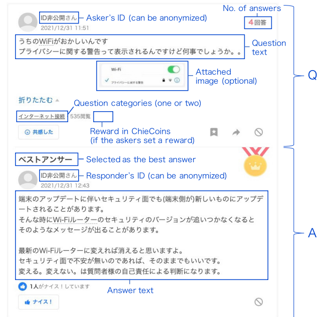
Fig. 1 Interface of a question in Yahoo! Chiebukuro.

We collected and analyzed security- and privacy-related questions posted on Yahoo! Chiebukuro (Yahoo! 知恵袋) [14], a site that was chosen because of its popularity and the wealth of features available to users (e.g., rewards for best answers, anonymous posts). In this section, we first