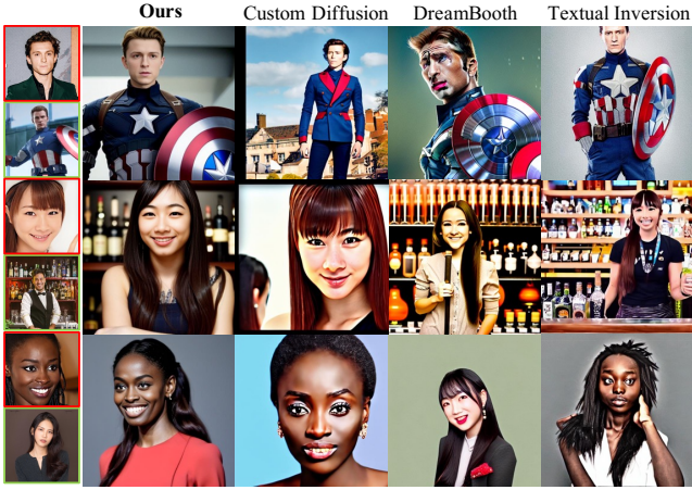
Figure 5: Qualitative comparisons of MagiCapture with other baseline methods.