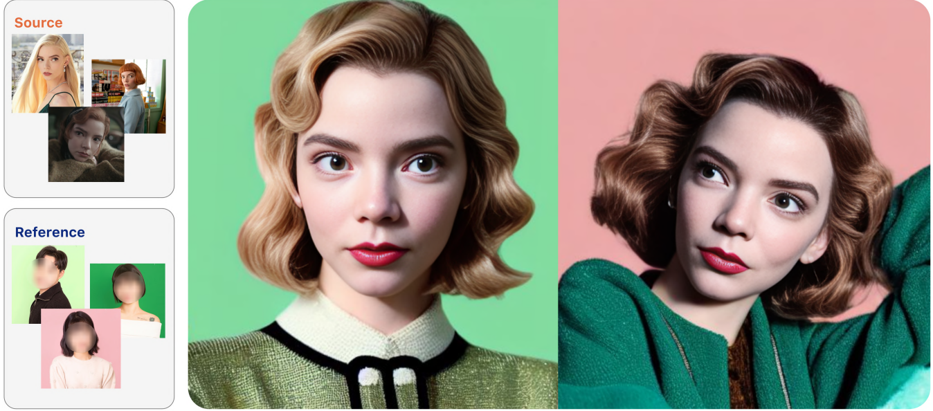
Figure 1: Generated results of the proposed MagiCapture, a multi-concept personalization method for integrating subject and style concepts to generate high-resolution portrait images using just a few subject and style references.