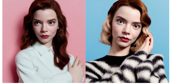
Figure 7: Failure cases: Proposed method occasionally produces abnormal body parts such as limbs, fingers