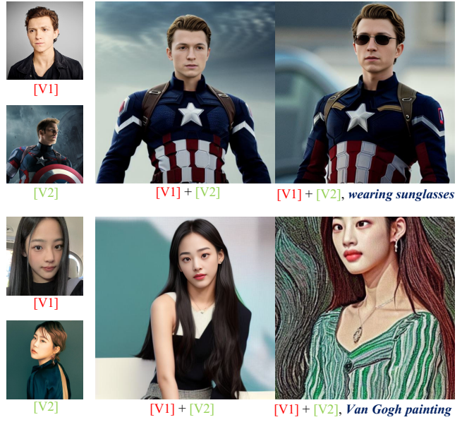
Figure 6: Users can further manipulate the composed results using prompts with additional description.

Applications. Since our method is robust to generalizations, users can further manipulate the composed results using prompts with more descriptions (e.g., c'_c = \text{“A photo of [V1] person in the [V2] style, wearing sunglasses.”} ). We demonstrate such results in Fig. 6 and in the supplement. Furthermore, our method is adaptable for handling different types of content, including non-human images. For methodologies and results related to non-human content, please refer to the supplementary material.