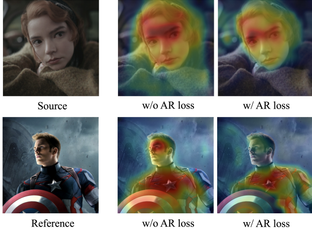
Figure 3: Visualization of aggregated attention maps from UNet layers before and after the application of Attention Refocusing (AR) loss illustrates its importance in achieving information disentanglement and preventing information spill.

Two-phase Optimization. Similar to Pivotal Tuning (Roich et al. 2022) in GAN inversion, our method consists of two-phase optimization. In the first phase, we optimize the text embeddings for the special tokens [V^*] using the reconstruction objective as in (Gal et al. 2022). While optimizing the text embeddings is not sufficient for achieving high-fidelity customization, it serves as a useful initialization for the subsequent phase. In the second phase, we jointly optimize the text embeddings and model parameters with the same objective. Rather than optimizing the entire model, we apply the LoRA (Hu et al. 2021), where only the residuals \Delta W of the projection layers in the cross-attention module are trained using low-rank decomposition. Specifically, the updated parameters are expressed as: