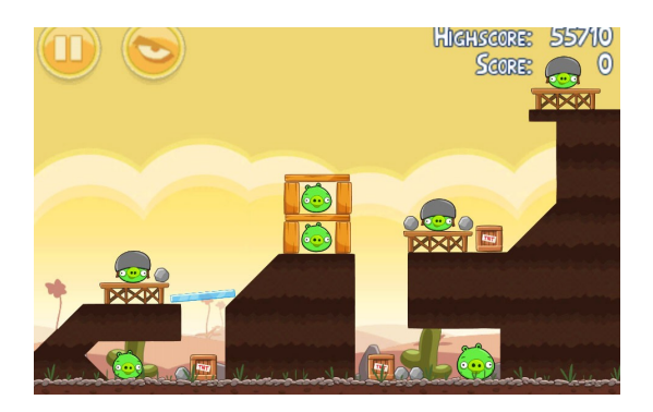
Figure 2: Difficult Angry Birds level.

line agents from previous competitions. For the convenience of the readers we have provided the complete domain, a problem file and the solution generated as part of the supplementary material with the submission.