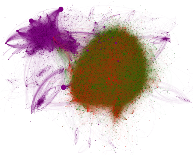
Figure 1: Account interaction graph. Takedown accounts are represented in purple, live accounts (still live as of December 2021) are green, and suspended accounts are red. Edge color represents the color of the target node. If there are bidirectional interactions between users, both edges are present. Edges are weighted by number of interactions.

Of 1426 users in the takedown dataset active in 2020, 1422 last tweeted in Jan 2020. 7 This indicates two possibilities: Twitter may have suspended many accounts from the takedown dataset at once in Jan 2020, or the Turkish operation was already transitioning to new accounts in anticipation of shutdown. During this time, they began interacting with accounts in the live dataset to boost visibility of newly created accounts through retweets and follow trains. During Jan 2020, takedown accounts interacted with accounts from the live dataset 530 times. 8 Of these 530 tweets, 455 were retweets and 72 were follow trains.