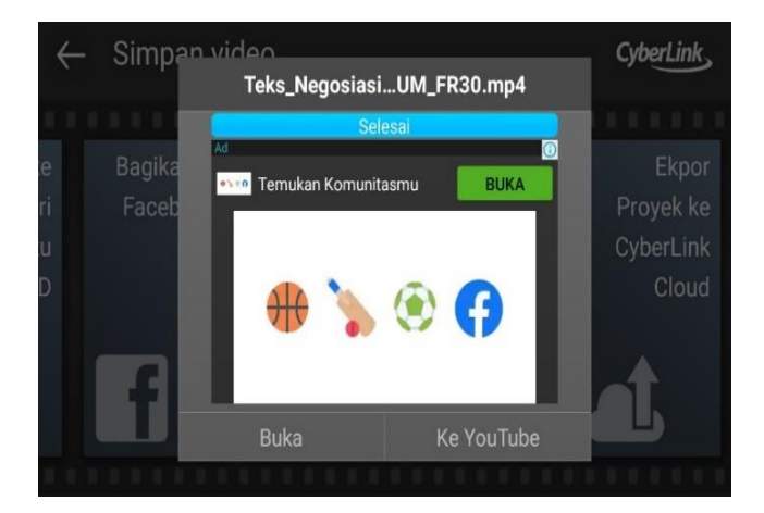
Figure 4. The material is ready to be shared on YouTube

The result of study by Az-zahra [29] shows that Power Director apps can be used in producing a combined video into MPEG-4 format to make song animation media. This application is used by Chen and Yeh [30] to convert all image files, animations, and video clips into MPG format. The trainer used Power Director Software to edit or produce videos for students [31].