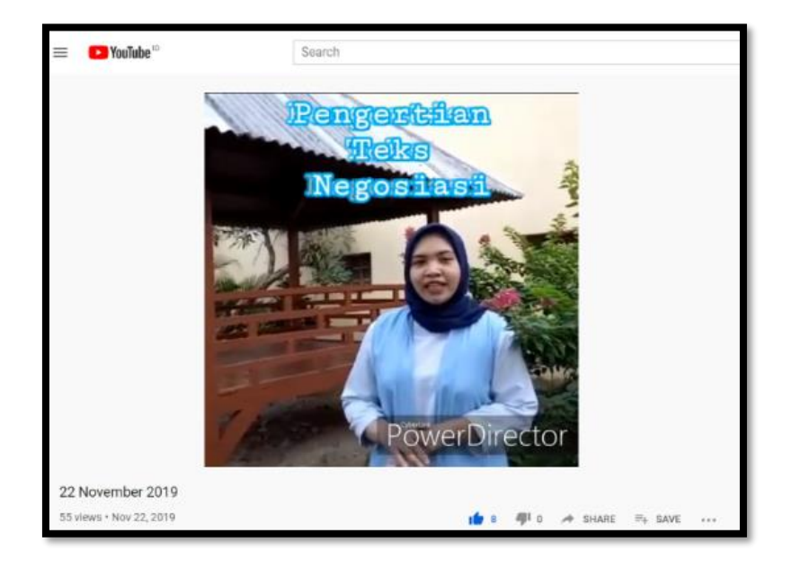
Figure 5. The display of negotiation text material in YouTube

One of the videos that had been created could be downloaded in https://www.youtube.com/watch?v=gLAqUjz KE8&t=73s. It could be seen in Figure 5.