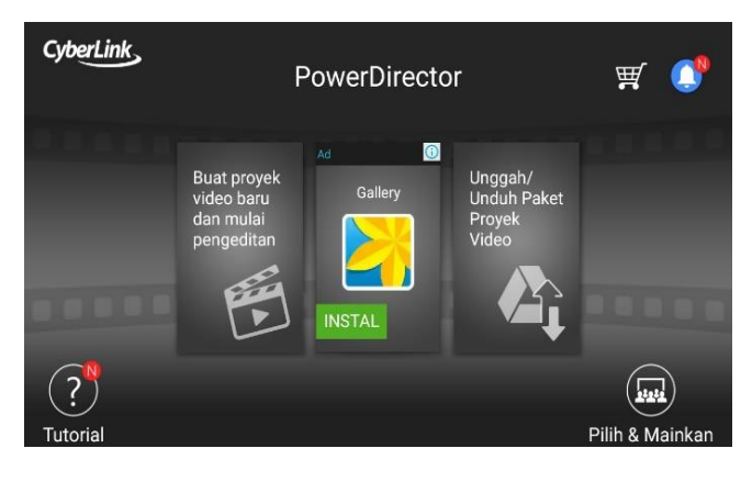
Figure 1. The homepage of CyberLink PowerDirector Apps

The display of CyberLink PowerDirector application can be seen in Figure 1.