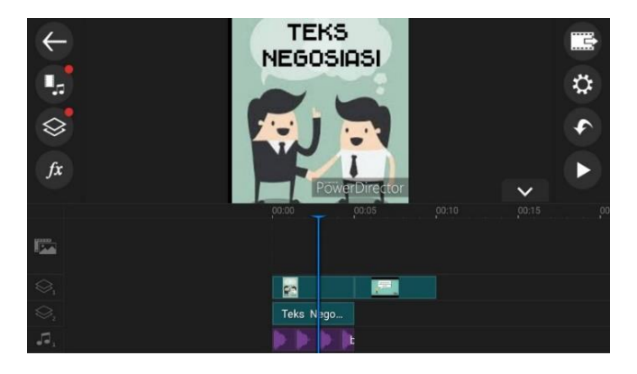
Figure 2. The Initial scheme of negotiation text material

The researchers began to compose the material of negotiation text using CyberLink Power Director apps via smartphone. This material contains a description of negotiation text, the structure of text, the examples of negotiating and writing negotiation text. The initial scheme of negotiation text can be seen in Figure 2.