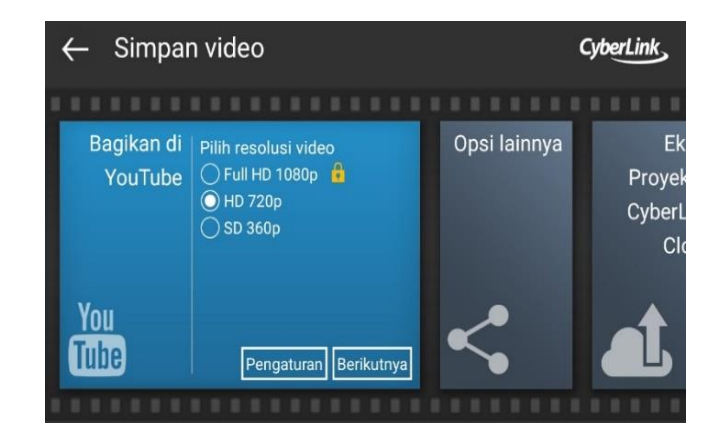
Figure 3. Share files on YouTube

The material that has been successfully created through CyberLink Power Director can be stored. The storage menu on the CyberLink Power Director apps can be: saved to the gallery or SD card, shared on Facebook or YouTube, export project to the CyberLink cloud. The researchers choose to store on YouTube because it syncs directly to Youtube and reduces the amount of memory usage in smartphone internal storage. The storage step can be seen in Figure 3.