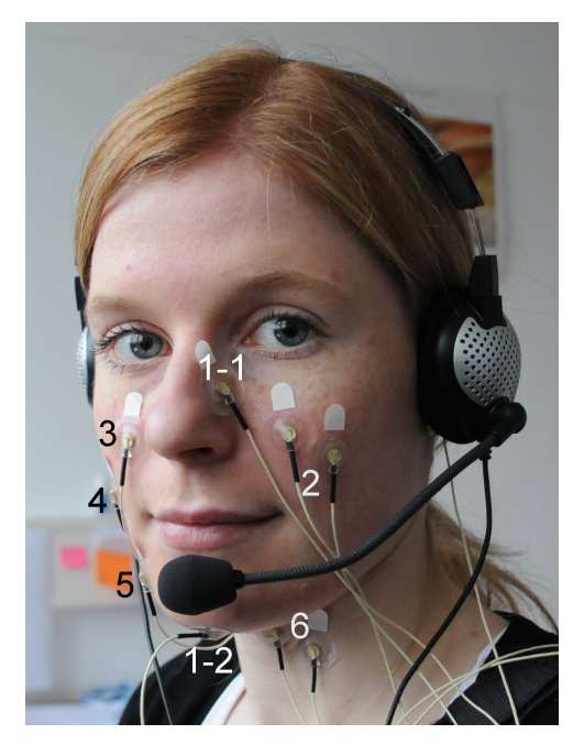
Figure 1: EMG-UKA electrodes with bipolar derivation (white) and derivation against a neutral reference (black numbers).