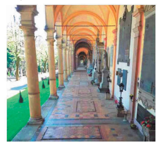
Figure 3. Example of a visual representation of the concept ( arcade ) in TMT: Zagreb, Arcades at the Mirogoj cemetery

This thesaurus is just a model for the comprehensive thesaurus of monument types that should cover all types of cultural heritage, limited to the architectural heritage, be it single buildings or built complexes. During the establishment of the core structure of thesaurus, the possibility of subsequent extension of the thesaurus to the other categories of heritage, such as historical settlements, cultural landscapes, archaeological sites, intangible heritage etc., has been foreseen.