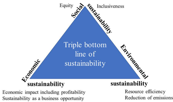
Fig. 1. Triple bottom line of sustainability.

Social sustainability emphasizes the role of humans in sustainable development and contributions to societal capital where equity and inclusiveness are important considerations. Environmental sustainability refers to doing no harm to environment and minimizing the environmental impact, which requires careful management of e.g., materials and resources at all phases of products, services or processes. Especially reduction of energy consumption and GHG emissions are key criteria of interest. Economic sustainability refers to the actual economic impact of operations that include and go beyond the profitability of operations. In fact, solving major sustainability challenges presents a major business opportunity. Understanding sustainability from these three distinct but interrelated perspectives helps to identify key aspects related to sustainability in the specific context in question, such as the development and use of ICTs and more specifically wireless networks. Additionally, the interrelations of these three perspectives need to be considered carefully – positive development in one might negatively impact the other.