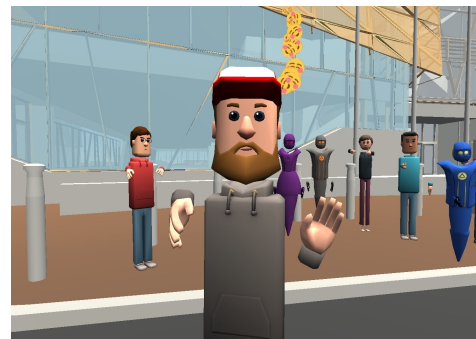
Fig. 1. Virtual Field Trip in Social VR.

Both public and private learning institutions are investing increasing time and effort in establishing online learning initiatives. At the same time, the software being developed for 3D authoring and social VR is advancing in both technical capabilities and accessibility to a broader audience of potential users and content creators. These tools and software packages take many forms and do not necessarily require advanced programming skills to achieve visually compelling results. “The field trip is the perfect metaphor for VR learning” [3, p. 190], therefore, many social VR platforms have facilitated user-generated projects that are designed to enhance the virtual learning environment (VLEs) with bespoke content. However, as the key participants and beneficiaries of emerging VLE platforms and new teaching practices, teachers and students may have had little involvement in their visioning, content selection, and operation. The practice we are developing seeks to encourage confidence in the use of 3D technologies through engagement with the process of content creation.