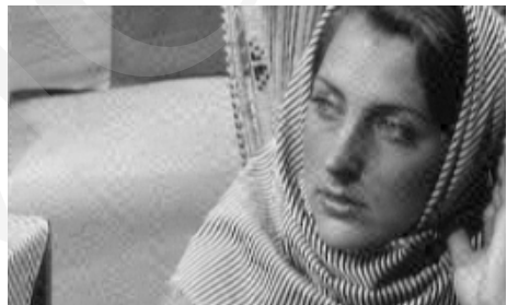
Fig. 5. Fragment of the original test image and its stegoed variant

The maximal length of a message is directly linked to the number of blocks (K), which are calculated from the proportion of image and block sizes. If the message is shorter than the maximal acceptable length, then it can be inserted in the cover image repeatedly. This approach is called redundant pattern encoding [18] and increases the robustness of the message to the intentional manipulations like compressing of filtering.