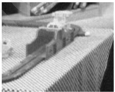
Fig. 3. Enlarged fragment of the test image compressed using the DCT-based (JPEG/JFIF) and 2DKLT-based algorithms

The decompression algorithm includes operations specified at the beginning, however, executed in the reverse order. It is worth noticing that the decompression stage does not require to calculate basis matrices as they are retrieved from a bit stream.