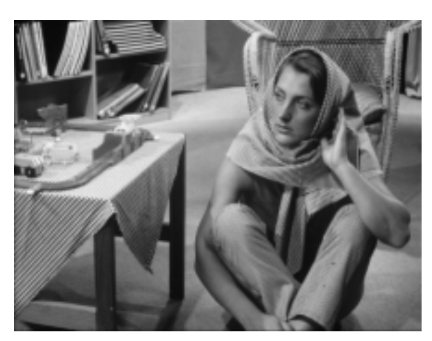
Fig. 1. Test image ("Barbara") used in experiments

In the further parts of the paper we show the main principles of 2DKLT together with the three application areas: image compression, image scrambling and information embedding. All the experiments have been performed on the standard benchmark images. The image "Barbara" (8-bit gray-scale, 640×480 pixels) shown in Fig. 1 is employed in all cases as an example, since it contains areas of different nature (i.e. smooth, detailed, edges, etc.) and a human face, on which any unusual artifacts can be perfectly observed.