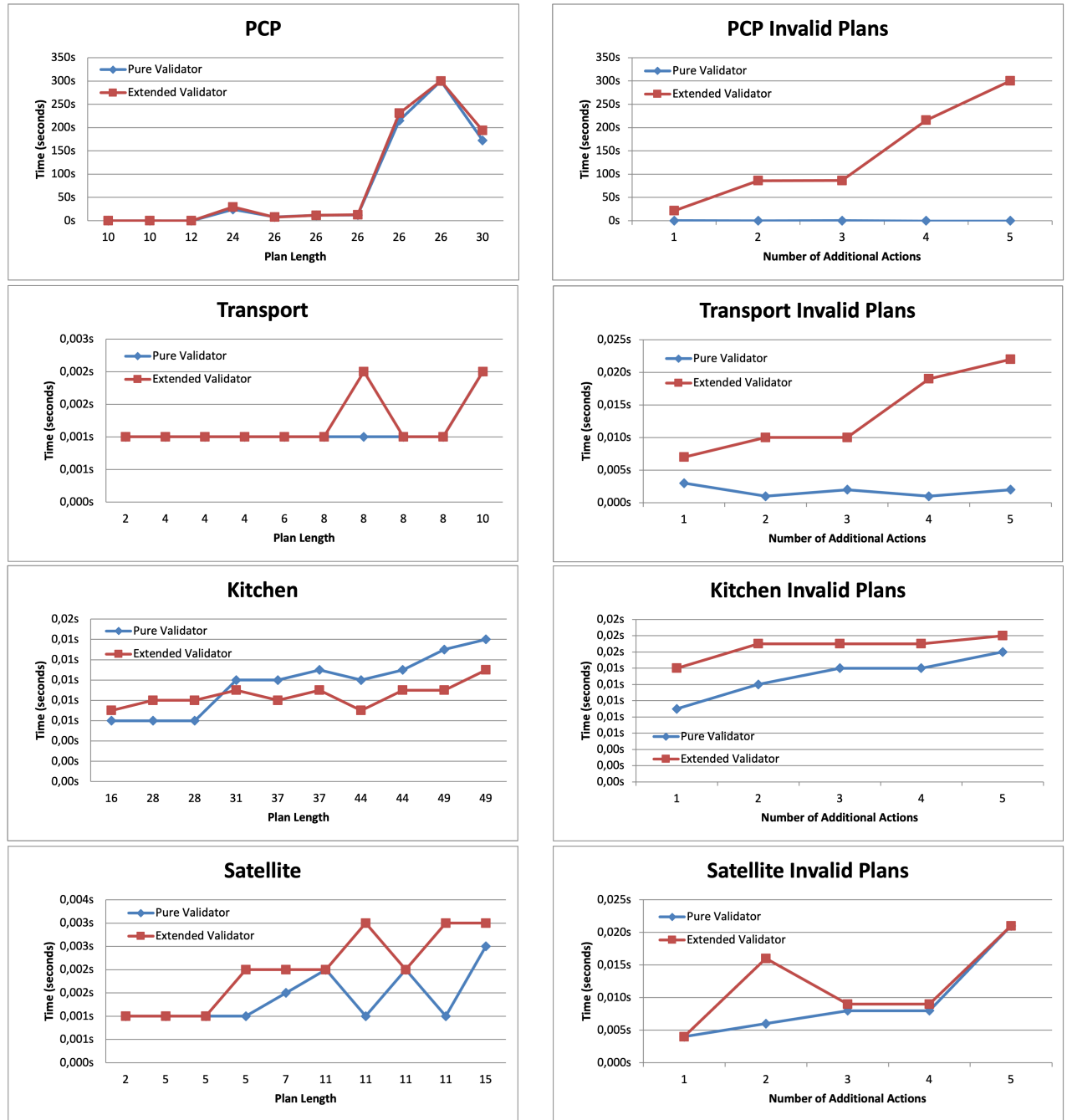
(a) Comparison of runtimes (seconds) as a function of plan length (b) Comparison of runtimes (seconds) as a function of the number of actions to be deleted (invalid plans).