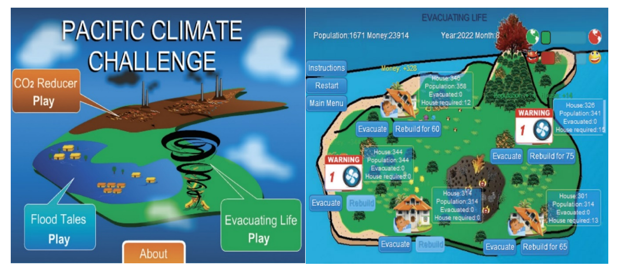
Figure 2: An Illustration of the Games (adopted from Fisher 2012)

and each component of the game was developed separately, several issues concerning the build and layout of the consolidated game arose during this phase as one developer highlighted: "The game came in three different formats, totally different interfaces. The developing process of the three people was quite different. It came as three totally different styles of game, different user interface, different colour, a lot of things were different. There was no standard look to the three different games. Fortunately, finally we got this sorted out - the three games now look quite similar."