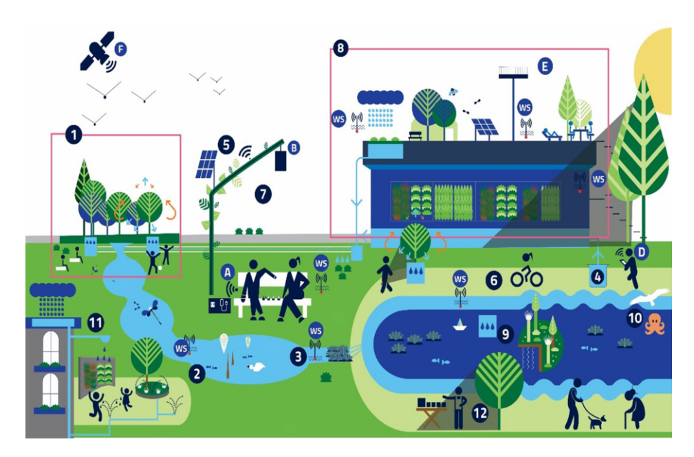
Figure 1. euPOLIS overall concept. 1. NBS-based MF pocket parks accessed by NBS locally conditioned pathways and shared spaces (1.1-1.9), 2. Waterway with mini biotope nodes, aquatic biodiversity – fead from groundwater aquifer or purified surface runoff, 3. NBS for surface runoff quality and pluvial flood management, 4. Groundwater abstraction for water, energy, greenery nexus, 5. MF NBS canopy for socializing, "recharging electronics", or "green bus stop" etc., 6. MF Live vegetation shaded waterfront promenade, 7. Air pollution abatement shrubs, trees and vertical green curtains, 8. Metabolic hub with MF ecotechnology demonstration/promotion, roof garden and art/culutural performance, 9. MF floating island, river water purification, 10. Coastal sea bottom marine aquatic biotope with euPOLIS-NBS, 11. MF euPOLIS Urban square/streetscape and other NBS (biotopes, sensory garden, waterfall, biodiversity kitchen garden for socialising, recreation), 12. Space for NBS business activation and promotion Monitoring- ICT System: A. Wearable devices for monitoring PH WB, B. Visualisation equpment, C. Renewable energy sources, D. Citizens observatories, E. Sensor network, F. Remote sensing, WS. Micro climate / wireless weather station.

project, i.e. Palermo, Limassol, Trebinje and Bogotá. The sixth STO includes the creation of long-term data platforms securing open, consistent data points about the impacts of the deployed approaches, mainly regarding PH and WB, and ensure interoperability with other relevant data infrastructures for effective public consultation, exchange and sharing of practices/experiences.