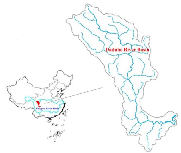
Figure 1. Location of the Dadu River basin.

The basin is prone to flooding due to heavy precipitation. Since 1956, several historical flood surveys have been carried out in the basin. The surveyed historical flood years are 1786, 1892, 1904, 1939, and 1955. Except for the mountain collapse-induced flood in 1786, the biggest flood in the investigation is the 1904 flood, followed by the 1939 flood. For the 1904 historic flood event, caused by rare and long-term rainfall in the upstream of the basin, the flood return periods in the upper reaches, the middle reaches and the lower reaches are more than 200-year, 100-year, and more than several-decade, respectively. The heavy flood in 1939 was mainly formed by the rainstorm in the middle and lower reaches.