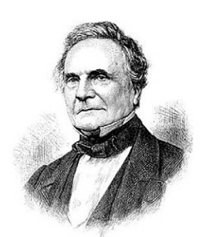
Fig. 6. Charles Babbage 1791–1871, Analytical engine.

A real breakthrough idea of using a computer for decision making came from the German engineer Konrad Zuse (1910–1995). In 1934 he formulated the first original thoughts about a potential program. Then in the period 1935–1937 he built the first relay calculator that was controlled by a program. Zuse's Z3 computer, which was operational in 1941, is now recognized as Turing complete and is therefore the first digital computer. (Note that the first computer design is attributed to the John Vincent Anatanasoff.) Zuse's importance for computer chess lies in the design of the programming language Plankalkül. He wrote about this: "Um klarer zu sehen, wählte ich, u.a., das Schachspiel as Modellfall aus und träumte davon, eines Tages den Schachweltmeister mit einem Computer zu besiegen."