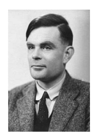
Fig. 3. Alan Turing 1912–1954 "Computing machinery and intelligence" 1950.