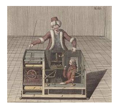
Fig. 5. 1770 De Turk.

Meanwhile, Babbage (1791–1871) developed his difference engine and analytical engine. Already in that time, he believed that the analytical engine if it was properly constructed could play chess. Since the realization of his belief was still far away, Babbage described a Tic-tac-toe playing program. Again, the description was fine, but there was never an actually playing program.