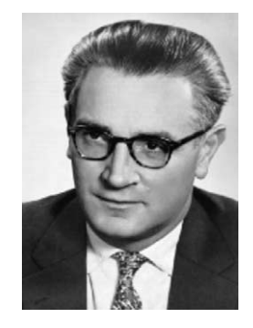
Fig. 8. Konrad Zuse 1910–1995, Z3 machine.