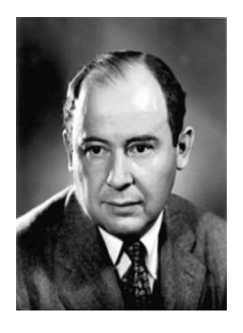
Fig. 7. John von Neumann 1903–1957, Minimax method.