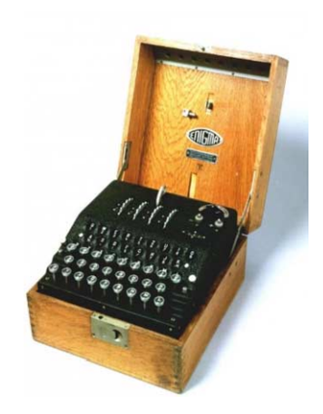
Fig. 2. Enigma a-320 (WW II) "Digital computers applied to games" 1953.