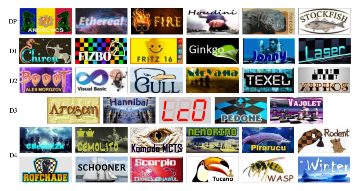
Fig. 1. Logos for the TCEC 14 engines (CPW, 2019) as in their original divisions.

The trio of STOCKFISH, KOMODO and HOUDINI have dominated the TCEC medals for several seasons and a key point of interest was whether others would reach the podium. LEELA CHESS ZERO and ETHEREAL were certainly expected to perform well in Division P, having shown remarkable improvement in the previous few months. KOMODO MCTS was a dark horse.