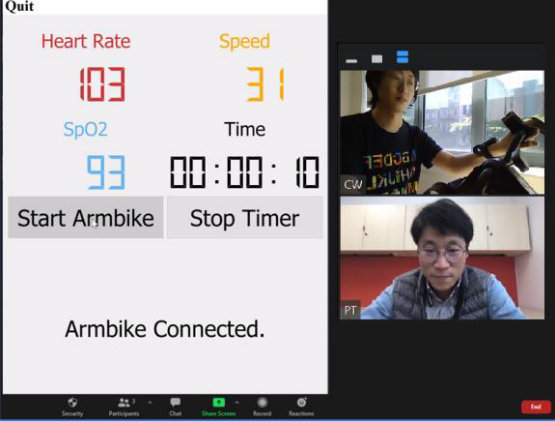
Figure 2. System Interface.