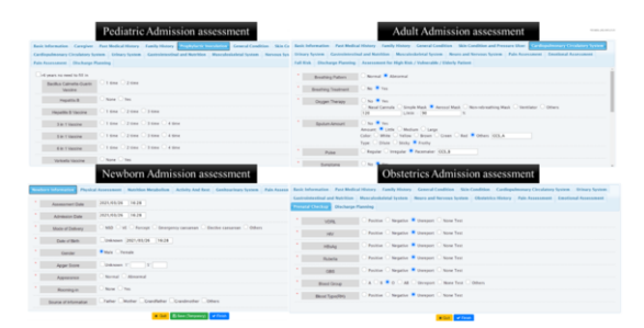
Figure 4– The different admission assessment (Adult Obstetrics pediatric Newborn)

Database design is very important for the NIS to have enough flexibility and scalability. Among the most commonly used admission nursing assessment items in many hospitals, there will be different special assessment items according to different age groups or different subjects. In the adult part, there will be Adult Admission assessment and Obstetrics Admission assessment, while the Obstetrics Admission assessment will include assessment contents of Prenatal Checkup and Obstetrics history. In the pediatric part, there will be a Pediatric Admission assessment and a Newborn Admission assessment. Admission assessment for pediatric patients will include the evaluation item of prophylactic inoculation, while Admission assessment for newborns will include the evaluation contents of Mode of Delivery, Apgar Score, Appearance, and Rooming-in, as shown in the following figure 4. However, the design framework of data tables will be the same (as shown in the table 2), so that there is no need to change the data tables because of different subjects or different evaluation items. This is the core concept of Master-Detail, which is also beneficial to program development.