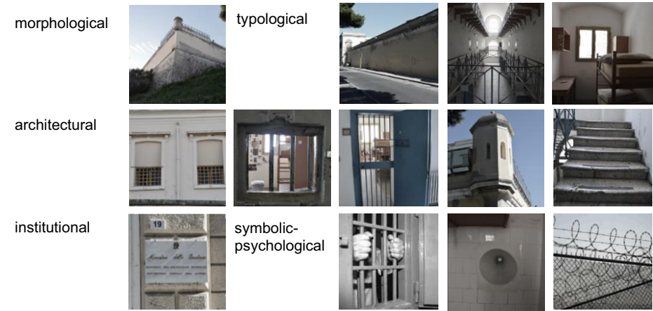
Figure 1. Barrier's Taxonomy. Design of the author.

It is with this aim that the barriers generally linked to prison structures, perceived and recognized differently by the prisoner population and by the city, are listed and discussed below (Figure 1).