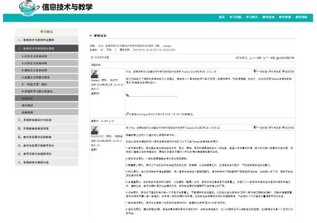
Figure 1. The discussion forum of "Information Technology and Teaching" course

The course platform, which was provided by Educational Technology Institute in Tsinghua University, kept an account of the moment-to-moment behaviors of the students in the whole process, including the date and time of the posting, posting sequence, identifier of the message poster, activity, interaction, and quiz results.