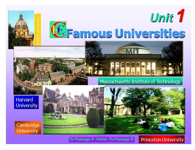
Fig. 1. Introduction to world famous universities

Design: In spite of their popularity in university, most of the existing MBTEL platforms are simply a group of slides or webpages on the contents of textbooks. The teaching effect is undoubtedly poor [10]. This calls for a systematic, scientific method to analyze, organize and coordinate the various elements of the teaching system, before integrating them into an optimal teaching plan. Below are two multimedia-based teaching cases designed by the authors.