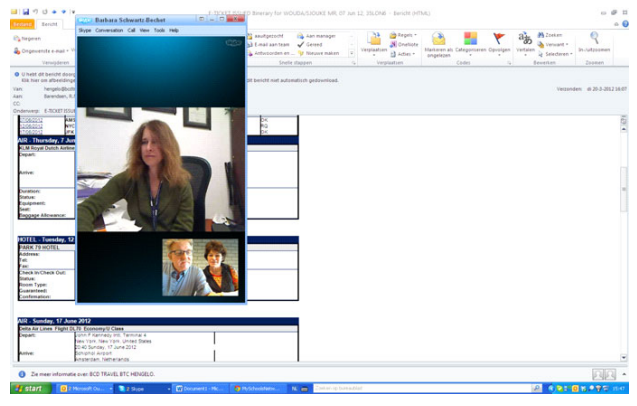
Figure 1. Representation of Skype Session

- the collaborative possibilities of modern technology. During the conference dinner we agreed to be in touch by means of Skype once we were back in our own countries to see how we might collaborate in order to bring in an extra dimension for our students.