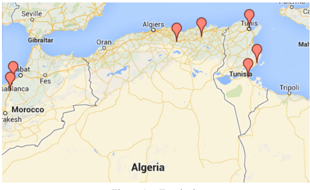
Figure 1. Test beds

The participants of the evaluation will be students and teachers of Universities from Maghrebian countries that are participating in the project (i.e. Morocco, Tunisia and Algeria). The main test bed universities are the following (Figure 1):