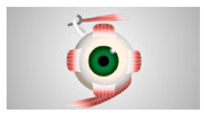
Figure 2. Screenshot of the Eye Muscles learning activity.

After the first step, the student can either reset the activity or go to the next tab to review and listen and compare the different heart sounds. Under the "Sound" tab, the location of the heart sounds remain visible to allow the student to build on their existing knowledge. There are several sounds that are provided in each location that they can select to listen to.