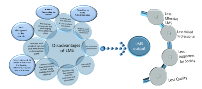
Figure 2. disadvantages of the current LMS and its result