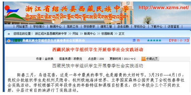
Figure 5. The web pages contains part Tibetan