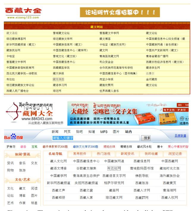
Figure 1. The navigation websites that provides the links of Tibetan websites