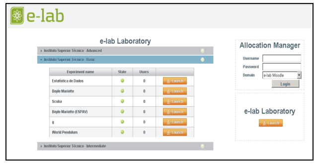
Figure 1. The rec.web interface main page. Providing access to the experiment's client applications.

In light of more recent developments and integration in different projects, e-lab underwent a new revision to what concerns platform stability and implementation of new features, both on the client side as well as on the developer's end.