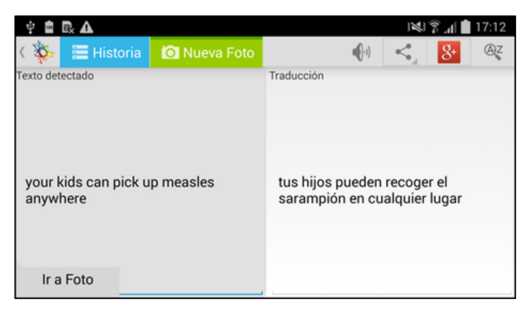
Figure 2. Encouragement for social participation in the Translation Tool by sharing text or images

User progress in terms of learning, or moving through content, is most relevant to two services: language learning and the game. In language learning, a user progresses through content, and can improve their scores in formative and summative assessments through repeated