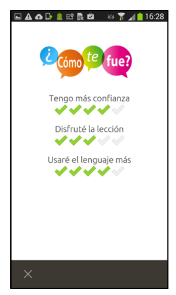
Figure 4. Self-assessment of confidence and enjoyment of language learning activities

users at various stages in the process. Whilst earlier trials and focus groups have focused on usability, later trials are conducting broader evaluations of use.