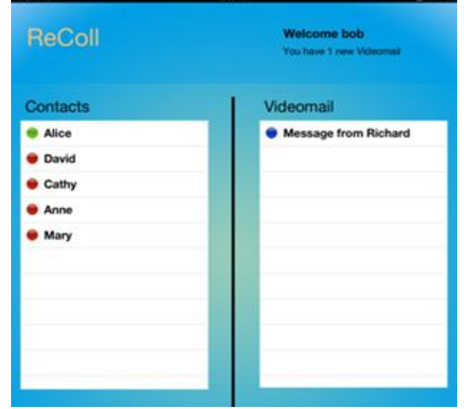
Figure 3. ReColl Access Control Screen

Though not implemented in ReColl , device authentication is helpful in providing a better security mechanism. This is to ensure that medical information are exchanged between valid mobile devices (i.e., truly the devices they claim to be), untampered (i.e., not compromised by an adversary), and correct (i.e., they are the right devices assigned to the desired patient). Mutual authentication can assist the device authentication so that the requests came from the device owned by a patient and response is sent from the device owned by an expert [8].