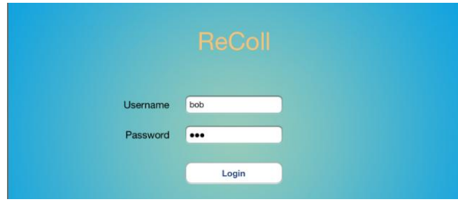
Figure 2. ReColl Log-in Screen

In ReColl , patient authentication is implemented by a login page that verified username/password combination as seen in Figure 1.