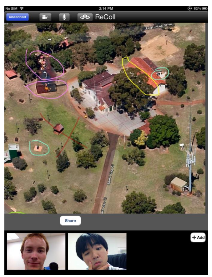
Figure 4. ReColl Shared Annotation

are designed to target specific system components (e.g., kernel or Core API service) or people (e.g., certain doctors), as well as identifying real-time changes to systems. More advanced adaptive system can automatically remedy any damage done by threats or at least report the damage so that human operators can act quickly to reduce further damage [27].