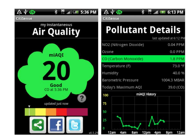
Figure 3. Phone interface. Left: Main screen shows current air quality in a large color coded cloud designed for easy glanceability. Buttons below allow for in-the-moment sharing of air quality with popular social networks. Right: The Pollutant Details screen gives curious users more fine grained information about the sensor readings. The graph at the bottom plots the maximum AQI recorded each hour.

The phone interface provides a way for users to gain instant access to their current air quality using the data collected from the sensor board. The phone interface is divided into two screens; the home screen supplies glanceable information regarding the current air quality, while the details screen provides the current reading reported by each sensor along with a graph showing the historical readings from that day.