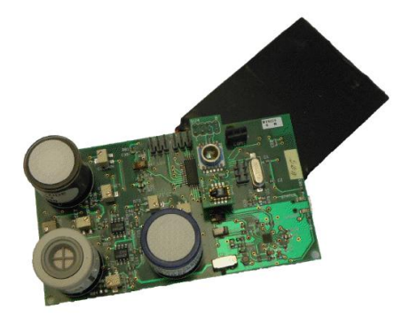
Figure 1. Internal view of the custom board. Sensors for NO2, O3, and CO are shown.

Semiconductor Metal Oxide (SMO) sensors that require heat to produce readings. Our sensor board connects via Bluetooth with the phone to provide maximum flexibility for users regarding where they carry the sensor board and where they carry the phone.