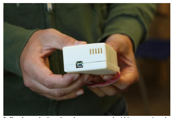
Figure 2. For the study these boards were encased within protective plastic cases. Holes in sides and top of the plastic case allow for airflow to reach the sensors on the board.

The sensors were each calibrated before being attached to the board using gasses of known concentrations to ensure accurate readings. The sensor board was then encased in a hard plastic shell with Velcro straps attached to the casing. The straps are designed so that the sensor could be easily attached to backpack straps and bicycle frames [Figure 2]. The battery life of the sensor board is roughly 5 days per charge.