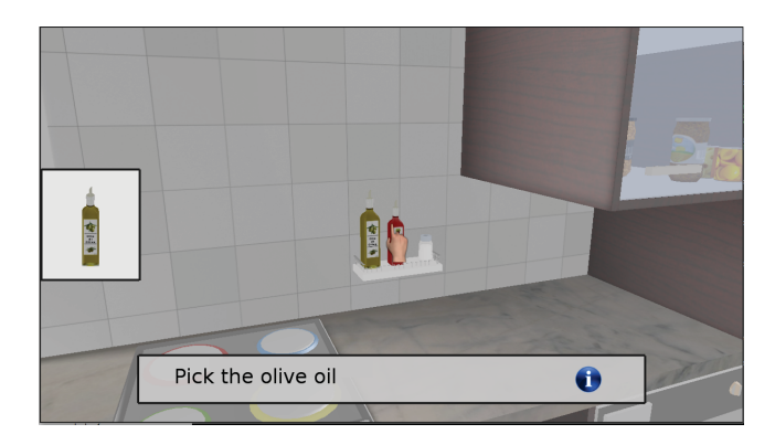
Figure 3: A view of task 1

The test consists of five tasks addressing different cognitive functions: executive functions (reasoning and planning), attention (selected and divided), memory (short and long term, perspective), orientation (visuo-spatial). Table 5 summarizes the tasks. The game starts with a traveling in the environment to familiarize the user with it. During the traveling, all the doors and drawers of the cupboards and furniture of the loft are opened to show their content. Then, there is a task of familiarization in which users practice the navi-