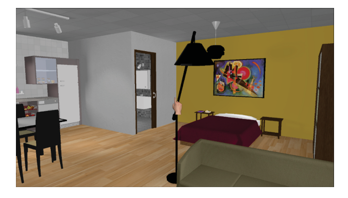
Figure 1: A view of the virtual scenario