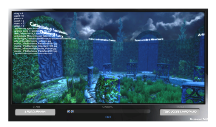
Fig. 6. Example: relation node of type "agent" (same character).

In order to exemplify the navigation in the 3D labyrinth on real data, consider the artwork Minotauromachia, a painting by Pablo Picasso (see Section IV-A). When posited in the artwork node that contains the Minotauromachia (Fig. 4), the