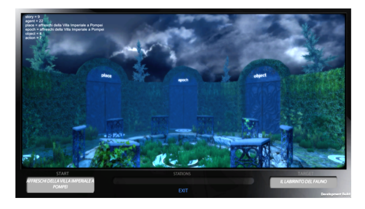
Fig. 5. Example: doors from start node, labeled with semantic relations (same place, same epoch, same object).

the keywords contained in the metadata of the items. Since the 3D labyrinth is dynamically created node by node, when new elements are added it is possible to verify how they are integrated in the 3D environment immediately after, and to assess how they affect the user experience.