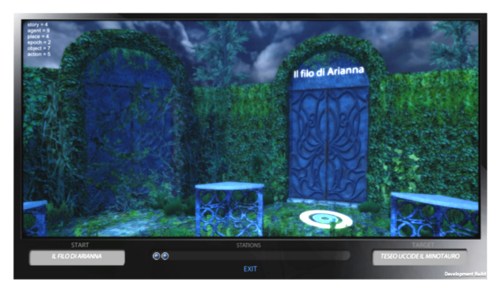
Fig. 7. Example: backtracking to "same object" relation: door to Ariadne and the thread

user is surrounded by a set of doors that represent the available semantic relations connecting it with other artworks. Fig. 5 shows a partial view of the node, with doors for the "same character" relations (labeled as "agent"), the "same object" ("object") and same location ("location").