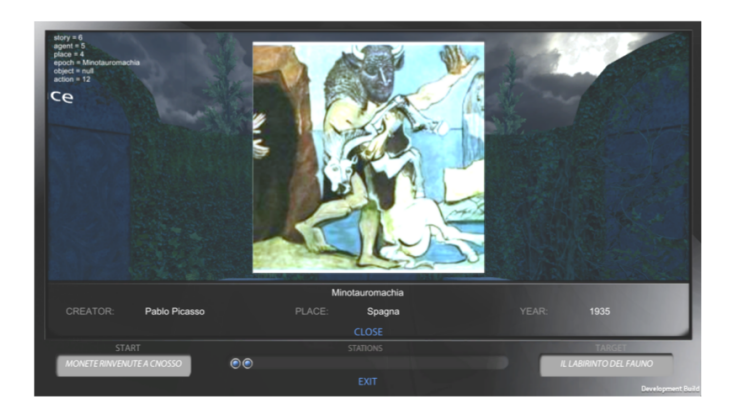
Fig. 4. Example: start node, Minotauromachia by Pablo Picasso.