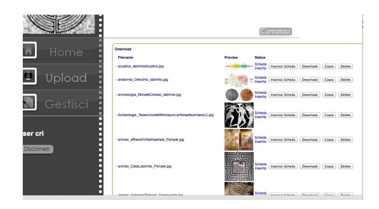
Fig. 3. A screenshot of the back-end of the system.

The artworks tagged as rartifactstory (the Knossos Palace, the book "El Labirinto Griego" by M.V. Montalban) and rartifactagent (an anonymous statue of Ariadne at the Vatican Museums, a Greek vase