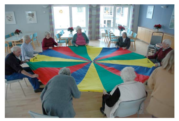
Figure 1. Exercise at Bjerggaarden. One of the week's high points.

The nursing home is kept in light colors, the atmosphere seems friendly and many walls are decorated with a variety of art. The elderly inhabitants individually points out that Bjerggaarden has a good reputation and that the surroundings are above standard.