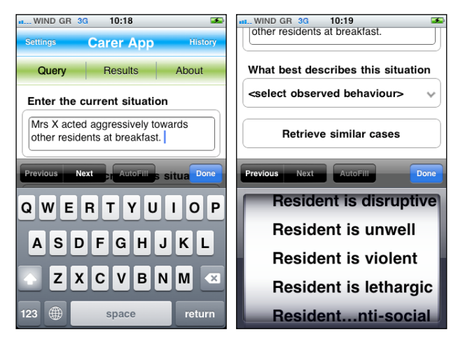
Figure 2. Describing a problem situation with the Carer app

The Carer app that care staff use to generate problem queries and browse retrieved case studies was developed using ASP.NET and the open source iWebKit framework for the iPod touch [5]. A user enters a natural language description of a problem situation using the text box shown on the left hand side of Figure 3, then refine it by selecting one of the observed behavior values such as Resident is violent shown on the right. When the user presses the Retrieve similar cases button the app automatically generates a query that it fires at the case study repository.