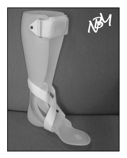
Figure 1. A rigid ankle-foot orthosis, courtesy of the Neurobiomechanics team, Southern General Hospital, Glasgow, UK