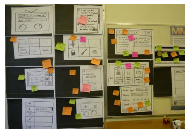
Figure 6: Live coding performed in design sessions.

The sessions were also recorded using a digital audio recorder and a second researcher collected observation notes. A thematic analysis (based on the Framework approach [22]) was performed on the combination of the sticky notes, the audio recordings, and the observation notes. Due to the nature of the 'Keep, Lose, Change' Exercise, the first set of codes emerged by default from the sticky notes captured and organized in the sessions. The researchers then examined the notes and audio recordings for further themes and finally performed a third pass of coding to organise and categorise the full set of codes.