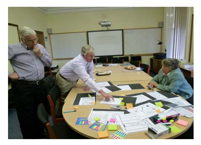
Figure 5: Users interacting with prototypes in design session.

The 'Keep, Lose, Change' exercise involved allowing users to interact with the paper based and interactive prototypes both individually and in groups. Colour coded 'Sticky notes' (post it's) were provided in order to allow users to capture issues and themes in real time (on the colour coded sticky notes) and indicate which features and interaction techniques and metaphors they would definitely keep (green sticky notes), lose completely (red sticky notes) and keep but change in some way (orange sticky notes) as they interacted with and discussed the prototypes - see Figures 5 and 6. This exercise allowed the older users not only to engage with the prototypes and provide feedback in real time, but it also encouraged 'live coding' of the emerging issues and themes done jointly between the researchers and the older users (see Figure 6). The feedback and issues collected were not limited to design features but could include emotional responses or anecdotes provided by the users when interacting with the prototypes.