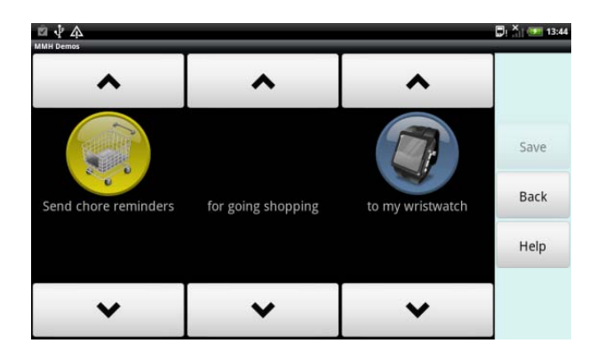
Figure 3: Screenshot of configuration interface for a tablet PC. Users can personalise which reminder to set and how it should be delivered

The designs incorporated a range of interaction techniques and metaphors in order to capture a wide variety of techniques for configuring the reminders. These included familiar home based interfaces (radio dials and 'heating panel' controls) and visual drag and drop (I want this reminder played to this device).