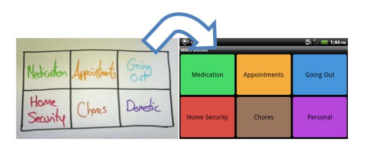
Figure 2: Paper based sketch and resulting interface design for reminder categories found in [11].

Prototypes were developed in Android and deployed on three different sized devices - HTC Desire HD Smartphone (4.3" device), HTC Flyer (7" device) and the Asus Eeepad Transformer (10.1" device). The working prototypes were useful to engage the users and to allow them to interact with the system and test out different interaction methods for configuring it. Using three different sized devices also allowed us to probe preferences for how reminder systems should be deployed in the home – via mobile phone apps, and via tablet PCs that can be placed on a table or fixed to a wall in the hallway, for example.