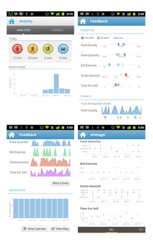
Figure 2. Snapshots of feedback graphics available in the ohmage Android application. Summaries and plots of general mobility states (still, walk, run, drive) captured from the continuous actigraphy trace (top left); graphic comparing baseline responses with responses from current week and past week self-report measures (top right); sparkline time-series and higher resolution time-series plots of various self-report measures (bottom left and right, respectively).

We will demonstrate the key features of the phone and server-side ohmage application. In addition, participants with Android phones will be invited to rapidly author and participate in their own campaigns. Data visualizations and feedback graphics will be available on participants' phones and on a website. Participants will be given usernames and passwords to provide secure access to their data. Data collection and graphics will be made available to participants for one month after the conference.