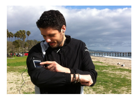
Fig. 3. Wearing the iPhone using the provided armband.

The game was tested using an iPhone 4S with a 3.5", 960 x 640 pixels display. A Belkin armband (Figure 3) was strapped on the user's arm of choice to hold the iPhone, and the user was provided with a pair of earbuds (that was sanitized after each use).