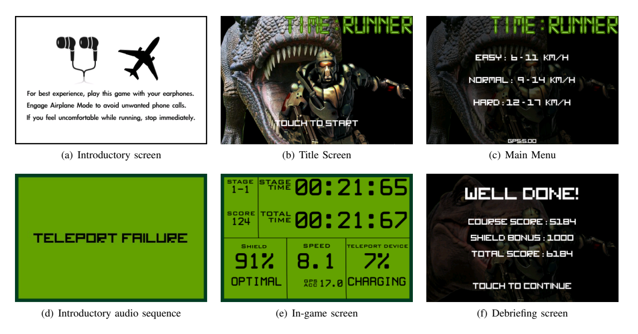
Fig. 2. Screenshots from Time:Runner. The title screen includes the "Futuristic Soldier" artwork by Dominik Zielinski (used with permission) and the dinosaur picture by Dave Catchpole (Creative Commons Attribution 2.0 Generic License).

narrator recommends to accelerate. In this case, the player's score is initially kept unchanged. If the player fails to speed up, then 5 seconds after the operator's warning the dinosaur will perform an audible physical attack, decreasing the shield efficiency by 9% and the player's score by 100 points (if the score becomes negative, it will be set to zero). The dinosaur will keep attacking every 5 seconds, until the player is able to bring her speed inside her chosen speed interval. If the player's speed is above the higher bound of the speed interval, the remote operator recommends to slow down, warning players that their high speed is causing localization problems for the remote team in their attempt to activate the emergency time travel system. During this phase, the player's score is kept unchanged.