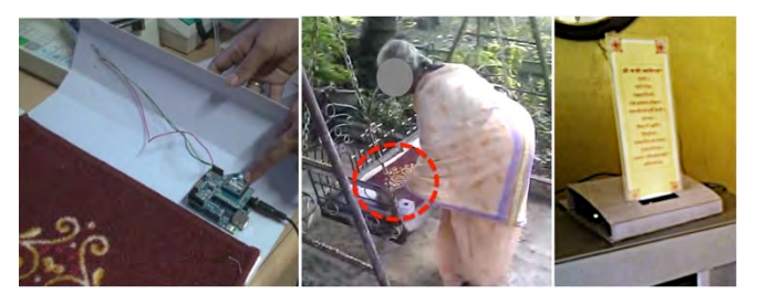
Figure 4. ReSwing Mat and Trophy sketch

We formed an early version of these visions in the form of ReSwing sketch. This design sketch consists of two components: a mat with an accelerometer connected to an Arduino and Zigbee module (Figure 4), and a trophy with three LED lights connected to another Arduino and Zigbee module (Figure 4). The trophy is designed to fit the aesthetics of the other trophies that she has in her home, with the text congratulating her and her husband of being successful in her rehabilitation program.