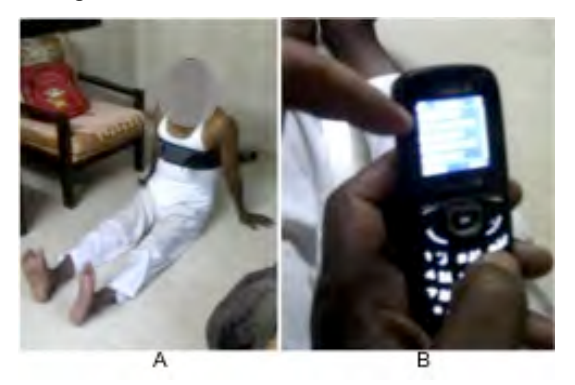
Figure 5. A: Trying out the ReBreath sketch, B: The text message after the exercise

From the phenomenological perspective, we saw how he engages with the weight-lifting exercises as resources to remain fit, and with the yogic breathing exercises as resources for being mentally agile for managing all the social activities he is involved with. He engages with his knee exercises only when he feels the pain in his knees.