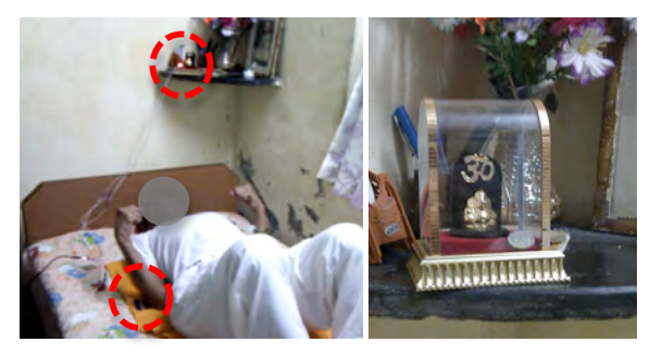
Figure 7. Prabhakar exercising with the ReExercise mat connected to the LED on Ganesha idol

Through the phenomenological lens we saw how Prabhakar engaged with Laxmi as a resource to motivate and guide him to perform the exercises. Further, we saw the way the couple engages with religious idols and spiritual activities as resources to deal with their displeasure about being old and lonely.