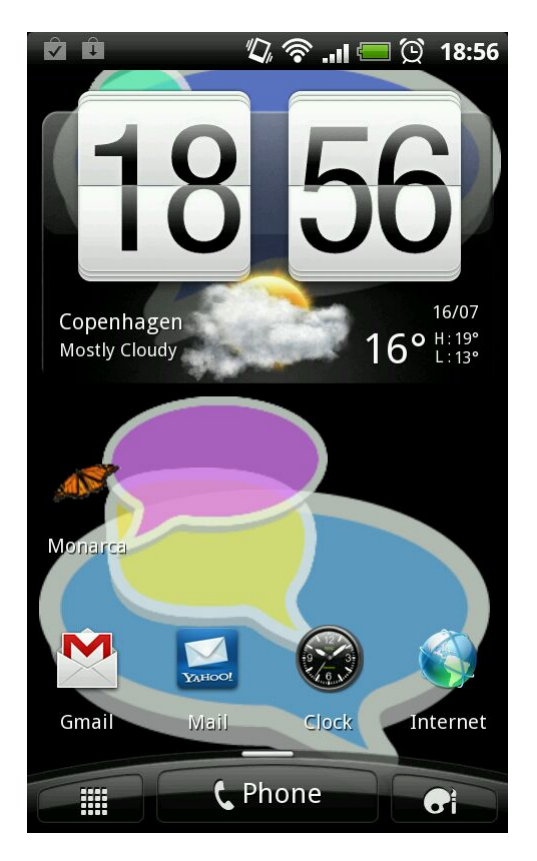
Fig. 2. The MONARCA Live Wallpaper bubble visualization.