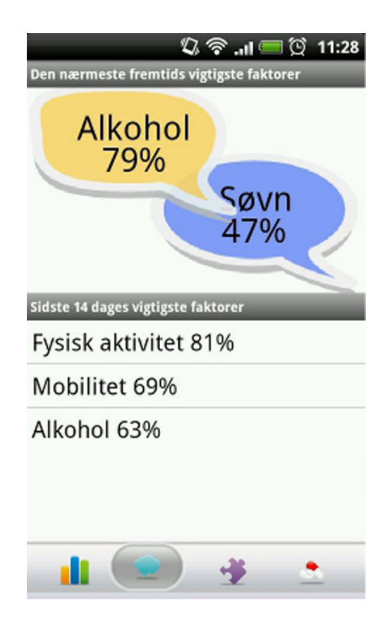
Fig. 1. An example of the impact factor screen from the MONARCA Android application, showing alcohol and sleep as important future impact factors, and physical activity, mobility and alcohol as past impact factors.