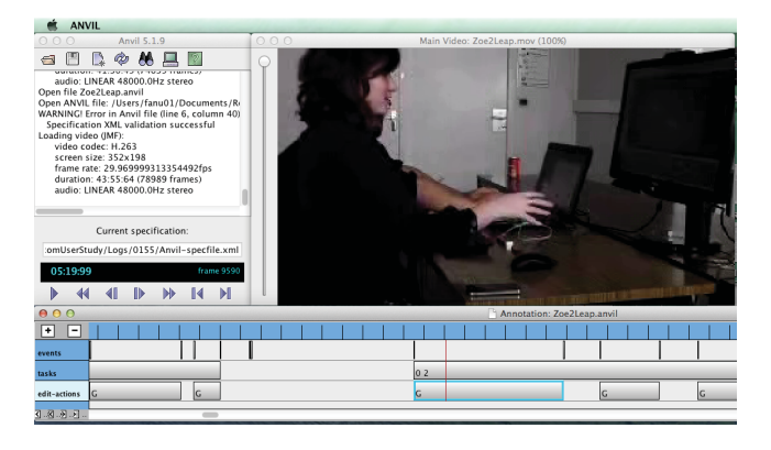
Figure 3: Screenshot of the Anvil annotation tool which the log and annotation channels synchonized