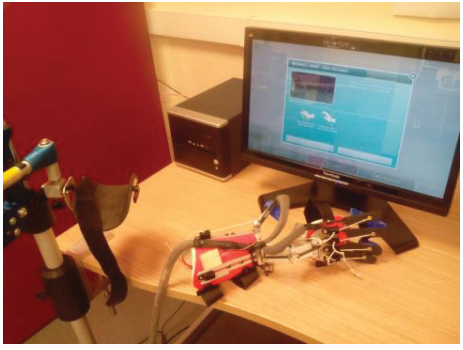
Figure 1 The SCRIPT system. Videos demonstrating the system can be found on the Youtube channel <a href="http://goo.gl/fpaZUD">http://goo.gl/fpaZUD</a>

Our approach for developing such component was that of defining a gesture recognition system which enabled subjects to control the games by moving their arm, wrist and fingers. This modular approach makes such interaction potentially expandable to other games and allows a more comprehensive training. Design and development was evaluated using formative assessment of the work with a triad of patients, their family members and their health care professionals. The system had then undergone summative evaluation with 20 patients. In this paper, we investigate how subjects focused on arm, wrist or hand training, based on their level of impairment.