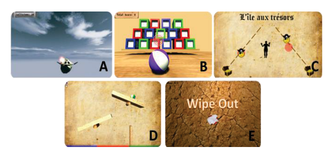
Figure 1. Specially developed games. A: Flight simulator (lateral translation of center of pressure (CoP)), B: hit the boxes (lateral translation of CoP), C: Follow me (oblique translation of CoP), D: Balls: (lateral translation of CoP), E: Wipe out (translations in all direction of CoP).