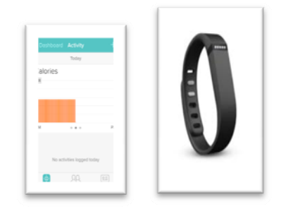
Fig. 2. Fitbit Flex band and app

The Fitbit Flex is an activity and sleep tracking wristband. Data collected can be synced wirelessly to an iOS or Android smartphone or a computer (via a dongle) with Bluetooth 4.0. It tracks steps taken, distance traveled, calories burned, active minutes, hours slept, and quality of sleep. The Flex shows daily progress on the wristband with LED lights and vibration, and shows statistics through charts and tables once the data is synced. Additional features include silent alarms, waterproof design, and sharing with other health and social apps. A picture of the device and the app software is shown in Figure 2.