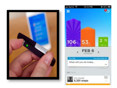
Fig. 1. Jawbone UP24 band and app home screen.

if they want to be reminded to remain physically active throughout the day, wake them up in the morning based on the optimal time in their sleep cycle, or even set a power nap alarm. The only display on the band is the sleep/awake status lights. As seen in Figure 1, a moon icon will light up to indicate sleep mode, and a sun icon will light up to indicate day mode.