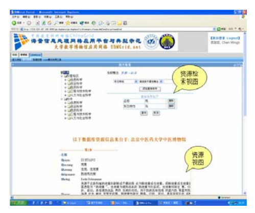
Figure 3. Semantic search service

In order to add a new museum resources to UDMGrid, the museum owners should use resource registration service to annotate their resources, the grid service developers need to modify the data access service to add new database, and the portal developers need to modify the portlet service corresponding to data access service in grid service layer, and there is no need to modify any other modules. The application service in UDMGrid such as semantic browsing service and semantic search service has considered different users' knowledge levels and motivation, providing good usability.