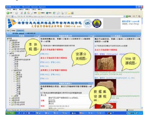
Figure 2. Semantic browsing service

Adopting the multilayer portal model for information grid, we have designed and implemented the portal of UDMGrid, as shown in Figure 2, Figure 3.