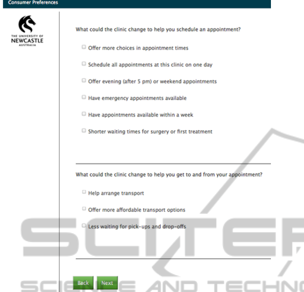
Figure 2: Meta-question and Dynamic Checkbox.

called meta questions that allow multiple questions to be conditionally displayed on the one screen.