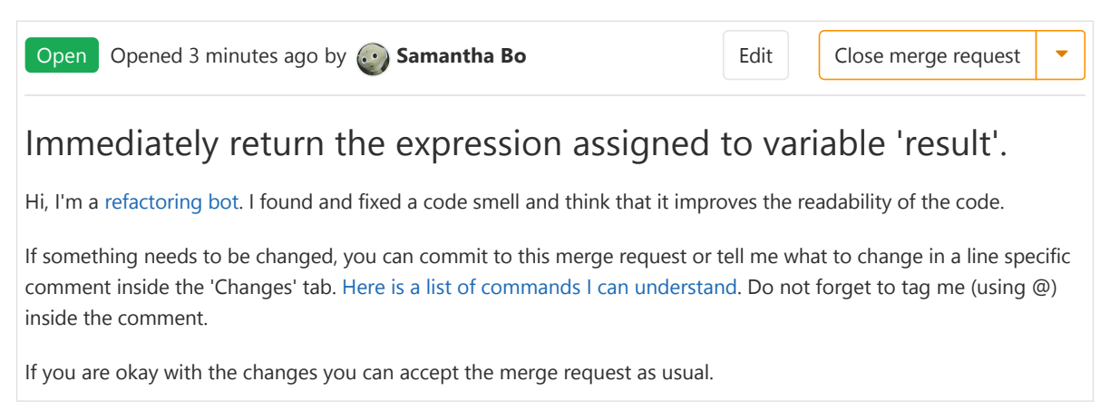
Figure 1: Description of a pull request proposed by the Refactoring-Bot, Samantha Bo.

The team members perceived the bot and its refactoring suggestions as useful and repeatedly stated that it offered additional value because it tirelessly improved code quality, which a developer may not be able to do because other things seem to be more important. The bot would break down a big block of refactoring work and suggest refactoring from time to time while at the same time working on new functionality would be possible. The bot would also behave unobtrusively. One participant was amused that the first pull request of the bot changed code that the team had never touched. Otherwise, the quality of the suggestions was found to be good and correct.