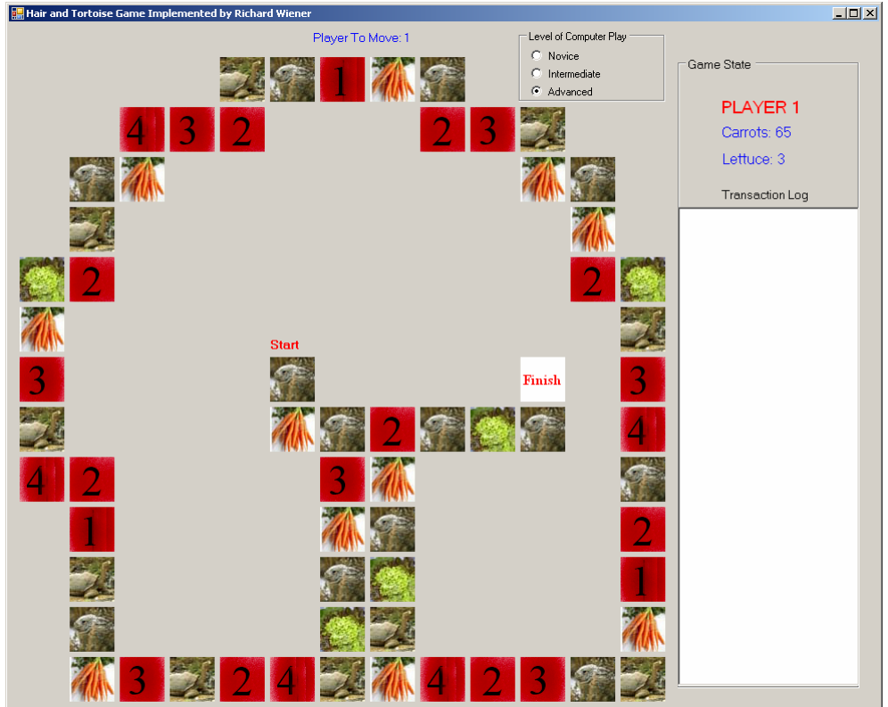
Figure 2 – Screen shot of initial board configuration

Although the shape of the board has been modified to accommodate the limited space available on the screen, if you look closely, you will see that the sequence of board positions is the same as in the original game.