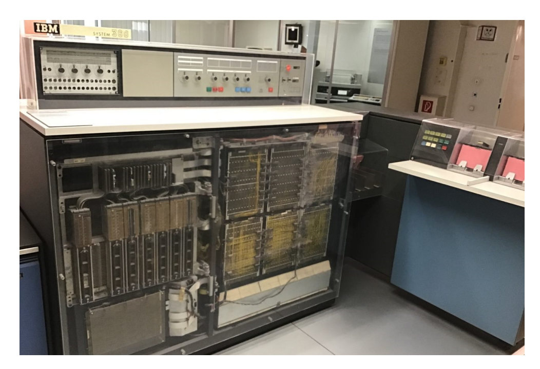
Figure 1 – IBM System/360, the mainframe for which Basic Assembler Language (BAL) was originally developed in 1964. BAL went through several versions and gained the name HLASM in 1992. For detailed history of the IBM assemblers, please refer to Blagodarov et al. [BJZ16]

level language (fine-grained or bespoke memory management, error handling, tailoring and optimisations, bit-level interoperability), others being legacy consequences of the software development process (e.g., avoiding the costs of a 3GL/4GL compiler) [BJZ16]. The main reasons for us to develop an HLASM compiler was to provide the option for our customers to migrate their existing HLASM codebase in the scope of a global migration off the mainframe into PC, Azure, Cloud-Native, etc. In such cases this option would allow them to ignore the presence of HLASM assets in their codebase until better times, and use a modern IDE later to help reverse engineering it and rewriting it with modern technologies. These HLASM assets are not meant to be kept operational forever: usually we see barely several thousands lines of HLASM within a typical portfolio of 20–200 million lines of code in higher level languages (there are known cases up to 343 MLOC at Bank of New York Mellon [Mit12], but the largest portfolio to have been migrated by Raincode Labs, is 250 MLOC [Rai19]).